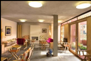
Maggie's Center – April