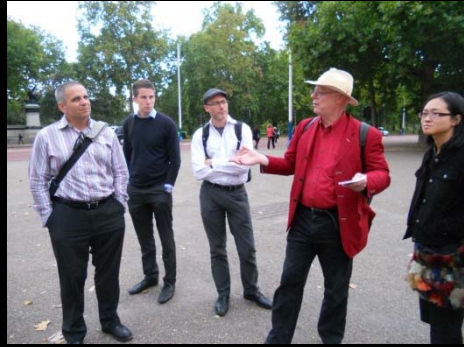
London Walking Tour